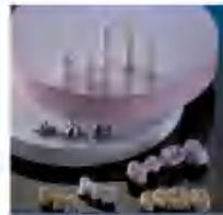
Ceramics for Medicine