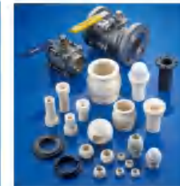
Hydraulics and Pumps