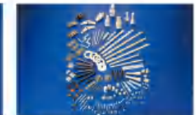
Special Structural Parts