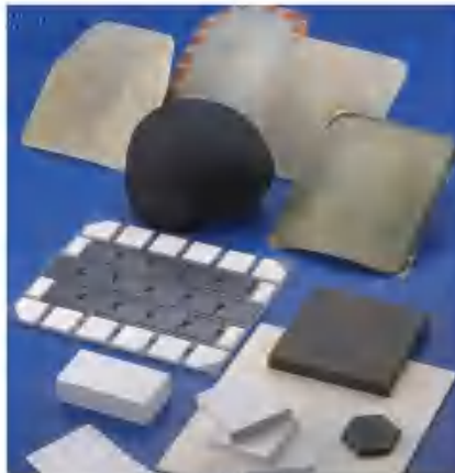
Ceramics in Military and Bulletproof Applications