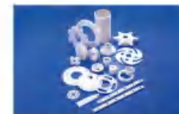
Ceramic Wear Parts