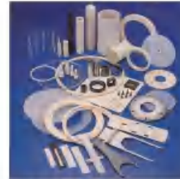
Ceramic Components in the Semiconductor Industry