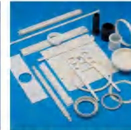
Ceramic Consumable Parts for the Optoelectronics Industry