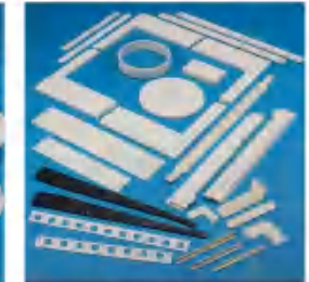
Ceramic Parts for Optoelectronics