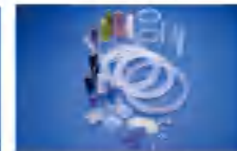
Sapphire Structural Parts