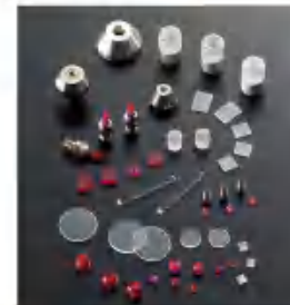
Ruby Structural Parts